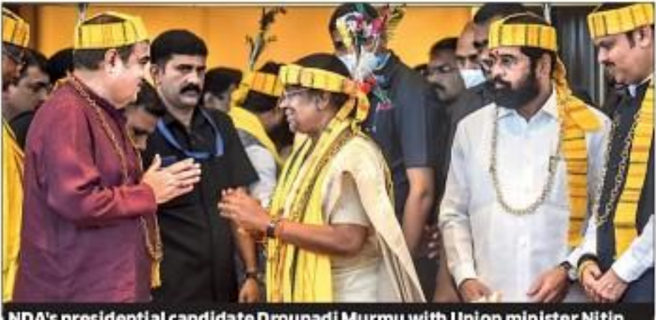
NDA's presidential candidate Droupadi Murmu with Union minister Nitin Gadkari, Maharashtra CM Eknath Shinde and BJP leaders in Mumbai

"The government has decided to make the change as a direct election for electing the sarpanches is the norm in