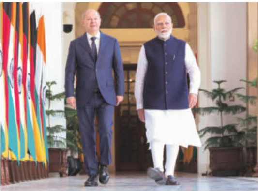
जर्मन चांसलर ओलाफ शोलज के साथ प्रधानमंत्री नरेंद्र मोदी

प्रधानमंत्री नरेंद्र मोदी ने आज कहा कि जर्मनी ने कुशल भारतीयों के लिए बीजा की संख्या सालाना 20,000 से बढ़ाकर 90,000 प्रति वर्ष कर दी है। जर्मन चांसलर ओलाफ शोलज तीन दिवसीय द्विपक्षीय भरोलत यात्रा पर हैं। प्रधानमंत्री नरेंद्र मोदी ने जर्मनी के कारोबारियों के 18वें एशिया-प्रशांत सम्मेलन को संबोधित करते हुए कहा, 'दुनिया की दो अग्रणी अर्थव्यवस्थाएं साथ मिलकर वैश्विक भलाई के लिए एक ताकत बन सकती हैं और भारत घोषणा पत्र ध्यान केंद्रित करने से इसकी रूपरेखा मिल सकती है। इसमें जर्मनी का समग्र दृष्टिकोण और रणनीतिक साझेदारी को आगे बढ़ाने की प्रतिबद्धता स्पष्ट तौर पर दिखती है। मुझे विश्वास है कि इससे जर्मनी की आर्थिक वृद्धि को और बढ़ावा मिलेगा।' पिछले साल नई दिल्ली में स्वीकार किए गए जी20 'कौशल आधारित प्रवास मार्ग' ढांचे के तहत जर्मनी के साथ पहला समझौता होगा। इससे शिक्षण, नर्सिंग और विनिर्माण जैसे गैर-पारंपरिक क्षेत्रों के भारतीय कार्यबल की आवाजाही में मदद मिलेगी। बिजनेस स्टैंडर्ड ने पिछले सप्ताह ऐसी एक खबर दी थी। सूत्रों ने तब बताया कि हाल के वर्षों में जर्मनी जाने वाले भारतीय कुशल कर्मचारियों की संख्या में वृद्धि हुई है और कौशल संबंधी व्यवसायों में काम करने वाले भारतीय कर्मचारियों की संख्या बढ़कर करीब 1,37,000 हो गई है। जर्मनी में कामकाजी उम्र की आबादी में गिरावट आई है और नई एवं उभरती तकनीकों में अपेक्षाकृत कम प्रशिक्षित कार्यबल एक प्रमुख समस्या बनती जा रही है। उदाहरण के लिए, जर्मनी ने 2024 के पहले 6 महीनों में 80,000 कामकाजी बीजा जारी किए और उनमें आधे बीजा कुशल