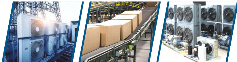
Suitable for HVAC System

Shakti's Simha Universal Drive is a unique product designed, developed and manufactured in India. This drive makes it possible to run industrial motor pump sets. It supports wide varieties of motors by virtue of its universal design. It's IP 65 design and rust-proof metallic enclosure provides protection from foreign particles (e.g. rain, dust, oil) which obsoletes the need for extra outer case. Therefore, this product is recommended by experts for it's unique features, efficiency, zero operating cost, plug and play installation, electrically safe user handlings and longer period of warranty.